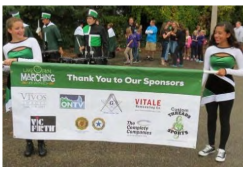
The Marching Band participates in Downtown Lake Orion Parades carrying our sponsor banner.